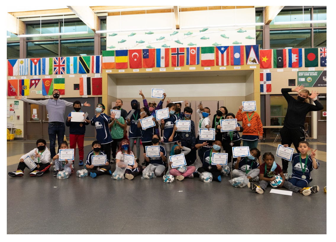
End of Season Celebration East Hill Elementary | Kent, Washington

Healthy snacks consumed by participants as part of the Soccer For Success program