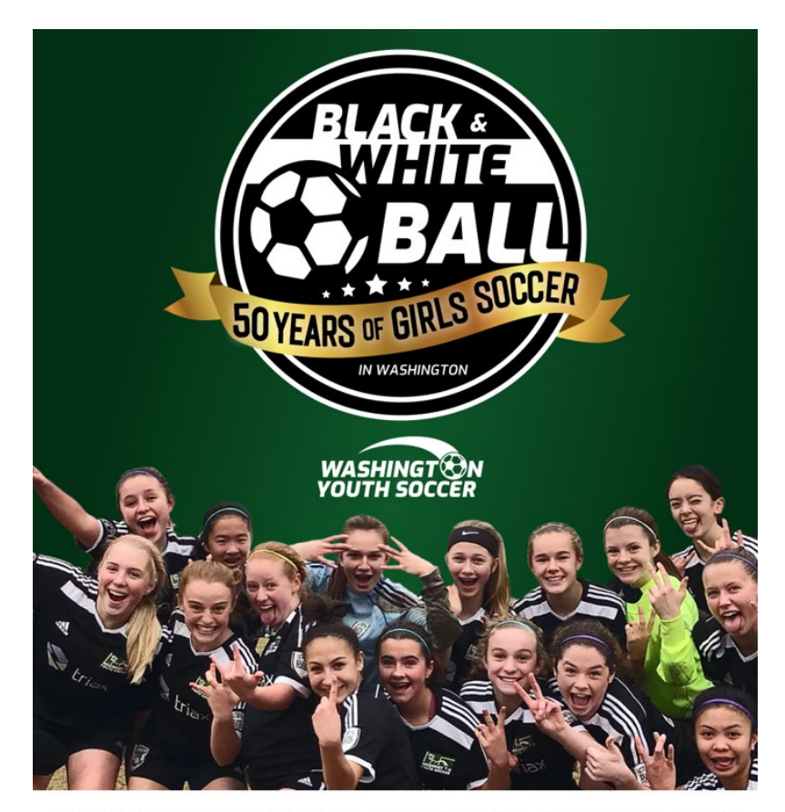
Saturday, September 24 at the Seattle Airport Marriott